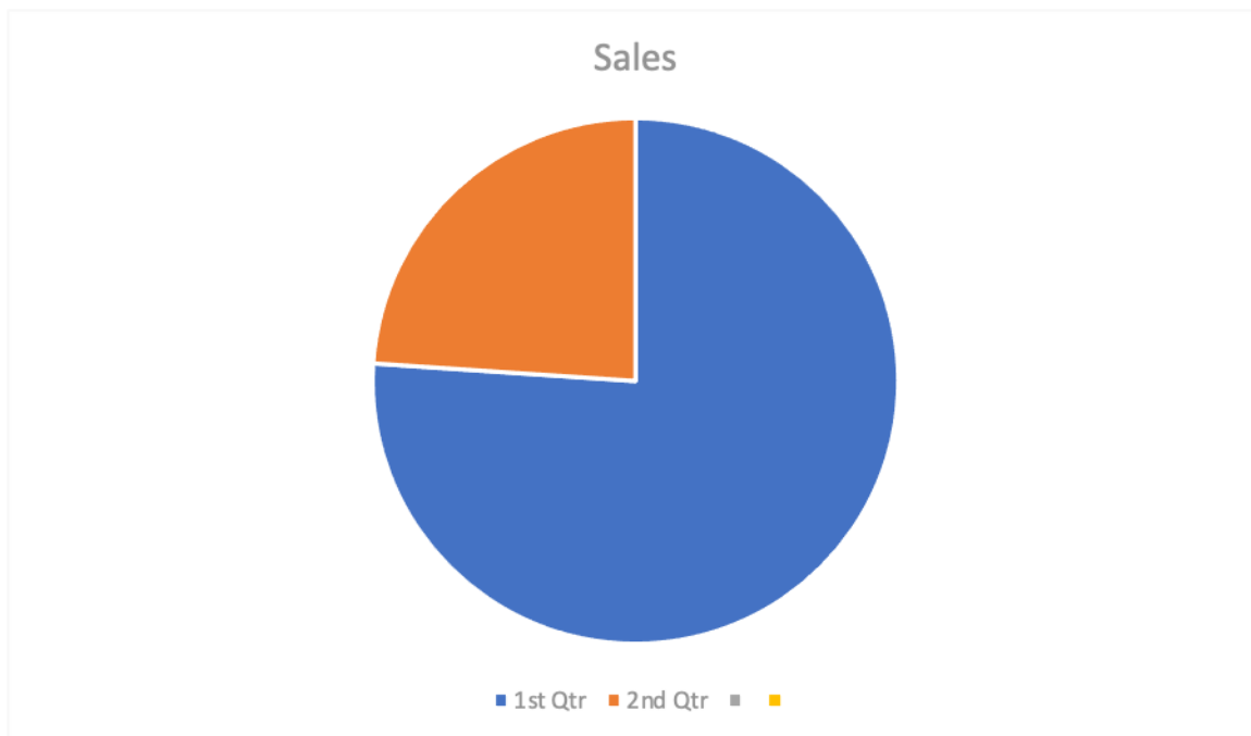
Figure 1. Frequency of males and females' occurrences.